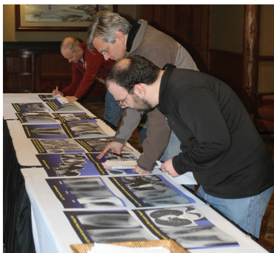
Oregon Thoracic Society Chapter – Annual Chest Disease Conference.

If there is no chapter in your region and you are interested in creating one, please contact the ATS Member Services & Chapter Relations Department at: chapters@thoracic.org or 212-315-8633