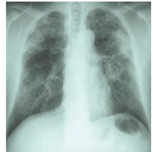
Miner with progressive silicosis.